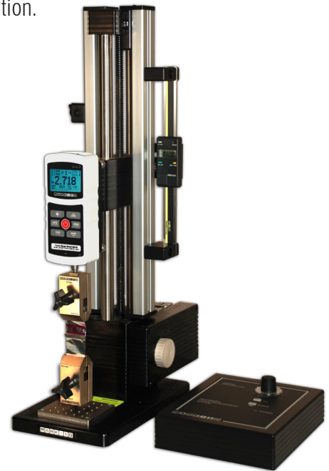
The ESM is shown in a typical tensile testing application, with Series 5 digital force gauge, digital travel display, limit switch kit, and wedge grips