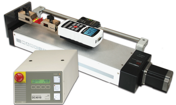
The ESMH-DC is shown in a peel testing application, with Series 5 digital force gauge, digital travel display, and pneumatic film & paper grips

The ESMH-DC's controller adds a significant amount of sophistication, including an extended speed range, PC control capability, programmable cycling, auto return, overload protection, and other features.