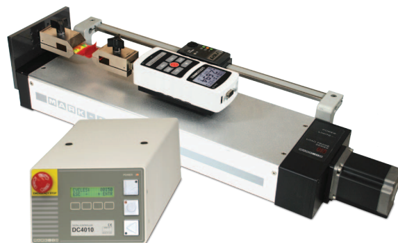
The ESMH-DC is shown in a peel testing application, with Series 5 digital force gauge, digital travel display, and pneumatic film & paper grips

The ESMH-DC's controller adds a significant amount of sophistication, including an extended speed range, PC control capability, programmable cycling, auto return, overload protection, and other features.