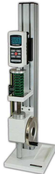
Shown with a TSF test stand in a spring testing application

The M5-1000's averaging mode addresses the need to record the average force over time, useful in applications such as peel testing, while external trigger mode makes switch activation testing simple and accurate. An ergonomic, reversible aluminum design allows for hand held use or test stand mounting for more sophisticated testing requirements. The M5-1000 force gauge is directly compatible with high capacity Mark-10 test stands, grips, and software.