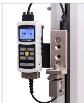
^ Optional AC1062 mounting kit adapts a Series R01 sensor to an ESM303 test stand.*