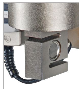
^ Series R01 sensor with shortened cable is shown mounted to an ESM1500LC test stand.*