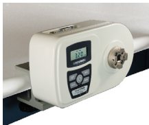
Optional bench mounting bracket