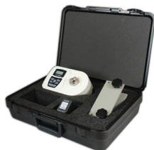
Optional carrying case