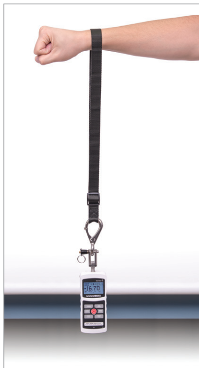
Force gauge shown in a vertical orientation

Force gauge displays real time force reading, peak force, and pass/fail indicators. The load cell shaft may be oriented in the up or down position, as demonstrated in the images below.