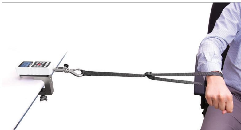
Force gauge shown in a horizontal orientation