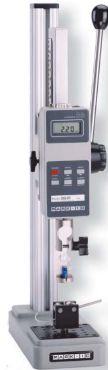
The TSB is shown in a wire terminal pull testing application, with a Series BG force gauge, wire terminal grip, and dual roller grip.