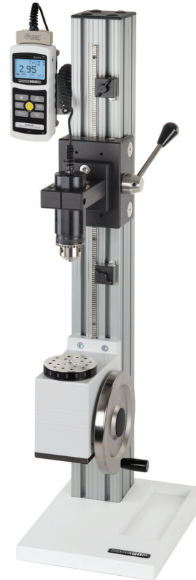
▲ The TST is shown with a Series R50 torque sensor and Model M51 force/torque indicator