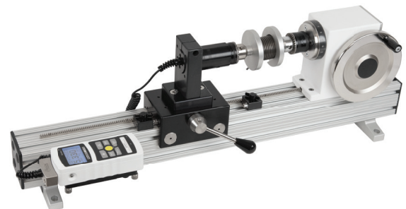
▲ The TSTH is shown in a torsion spring test, with Series R50 torque sensor and Model M51 force/torque indicator